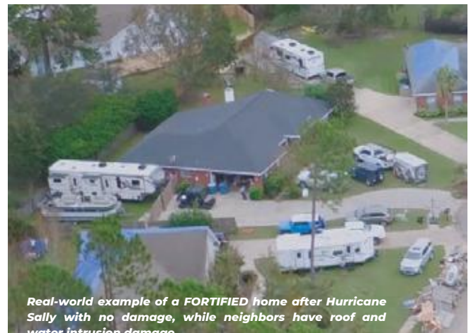
Real-world example of a FORTIFIED home after Hurricane Sally with no damage, while neighbors have roof and water intrusion damage.